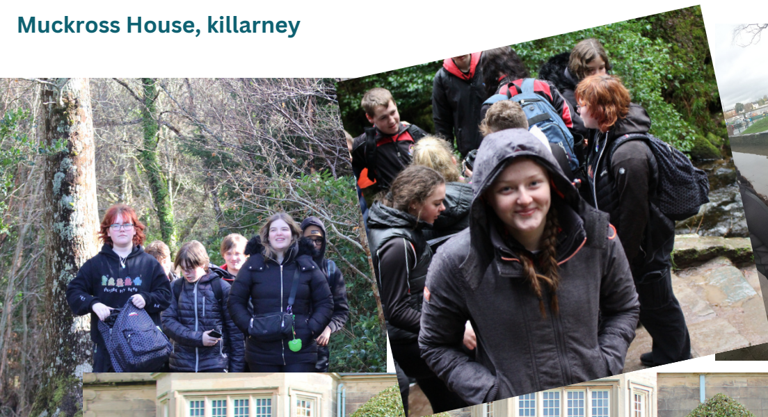
Muckross House, Killarney