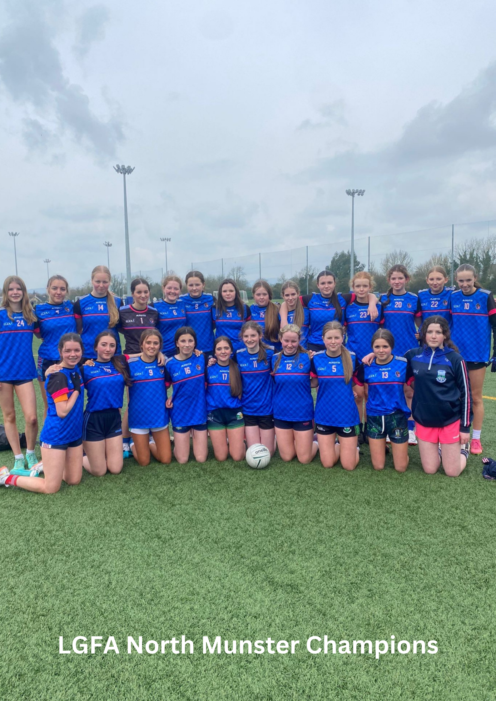
LGFA North Munster Champions