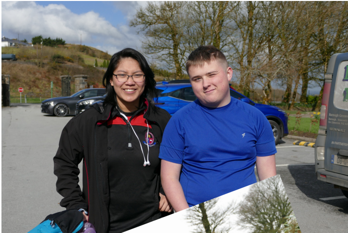
Cycling on the Greenway