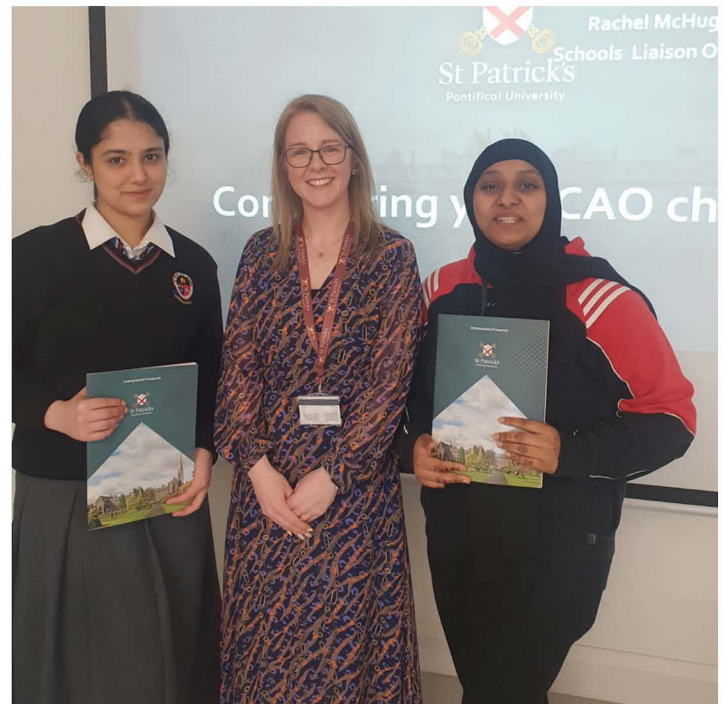
Careers Presentation by Pontifical University Maynooth