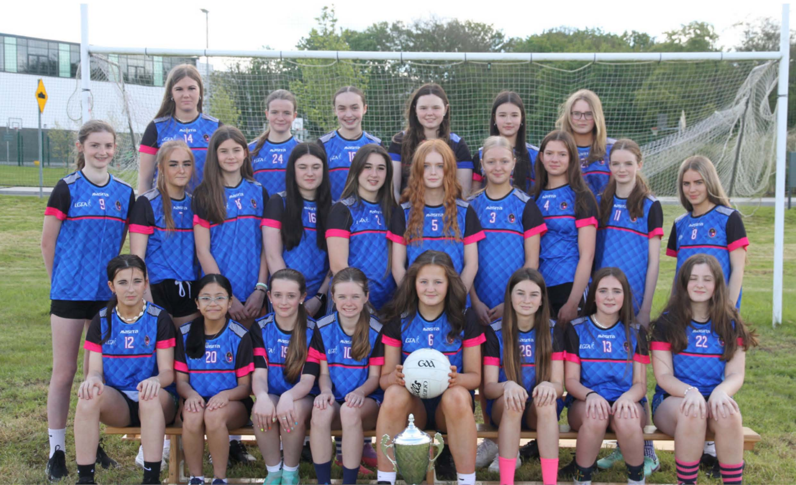
Girls Gaelic Football who were victorious in the North Munster Final