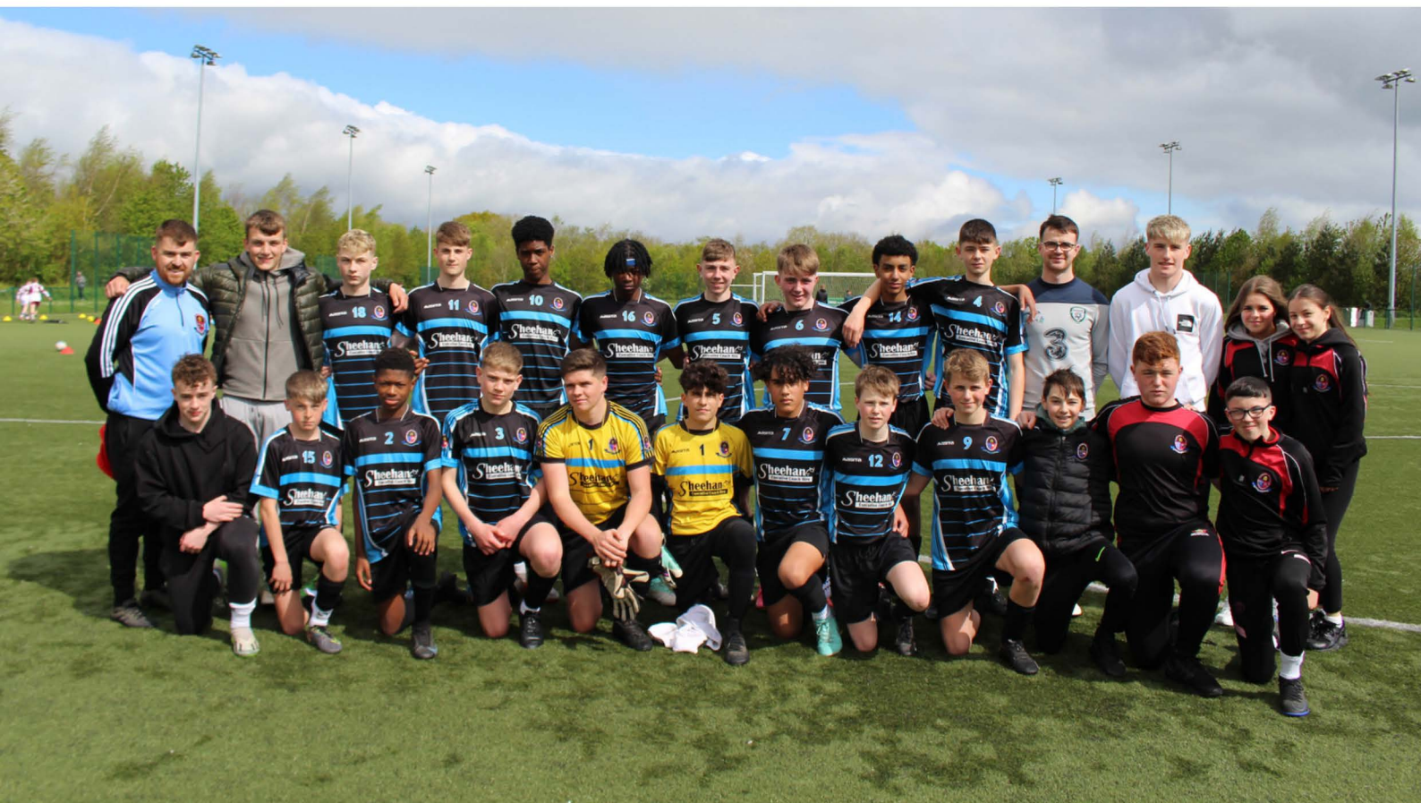
Under 15 Boys Soccer team - North Munster Finalists.

Unfortunately they were unsuccessful in the final.