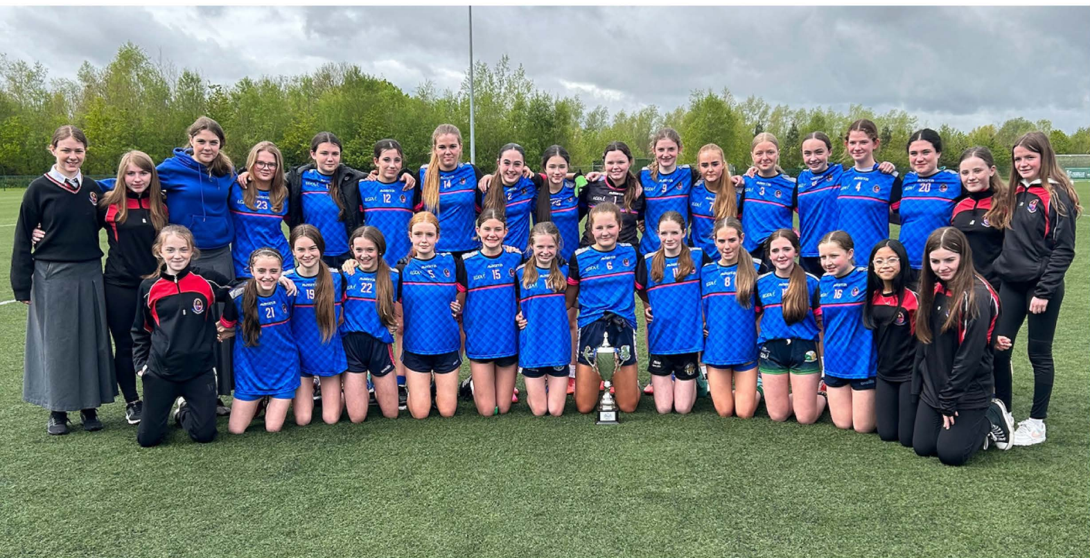
North Munster Under 14.5 Ladies Football Champions