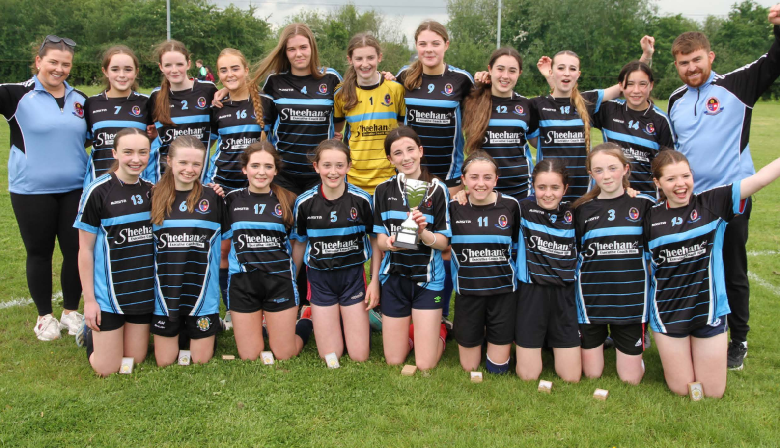
First year Girls Soccer team who won the Limerick District Final