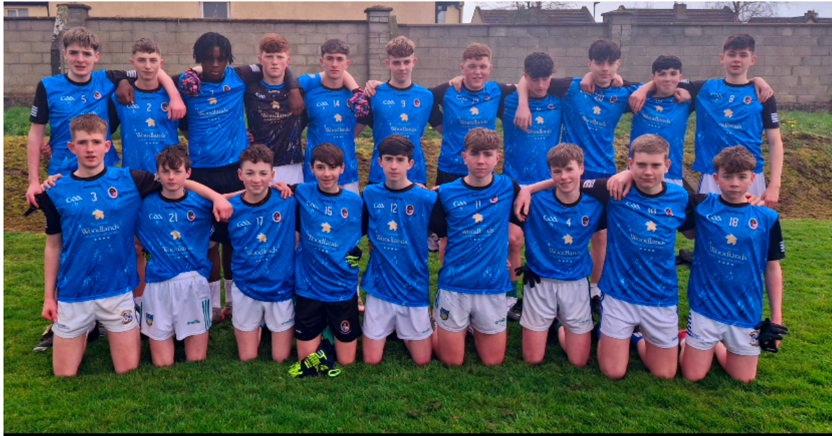
Under 17 Boys Football team who fought hard against Glenstal Abbey to succeed in Progressing to the Limerick Semi Final.