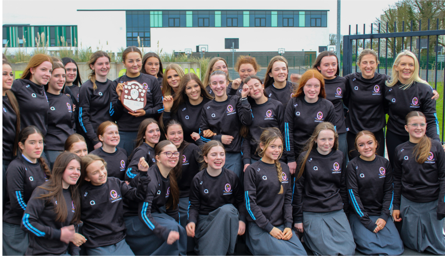
The Under 16 Girls Camogie Team who were crowned the South East Shield Munster Champions! . They were victorious over Comeragh College in The Final and received a heroes welcome arriving back to Coláiste Chiaráin